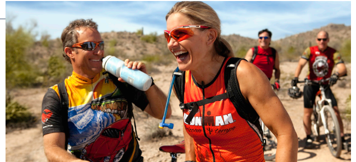
65+ Miles of Trails

At Estrella, we take a resident-first approach when it comes to creating a sense of community. It's up to you and your neighbors to decide the types of gatherings, activities, and events that best suit your life. By design, the picture of what it means to come together looks different for every Estrella resident.