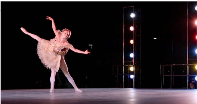
Ballet Under the Stars

On a smaller scale, dozens of fun and interest-based groups and clubs meet regularly in Estrella, each keeping their doors wide open for new members. From active fitness, running, and hiking club groups to art-centered meetups for photography and painting, every Estrella resident is bound to find plenty of ways to engage.